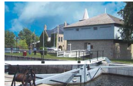
Merrickville Locks and Blockhouse (left) St. Laurence Street